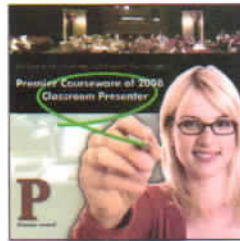
2008: Classroom Presenter